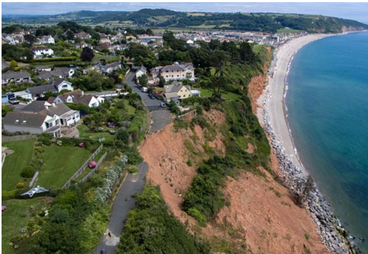
Figure The 2012 cliff slip at Seaton Hole, East Devon